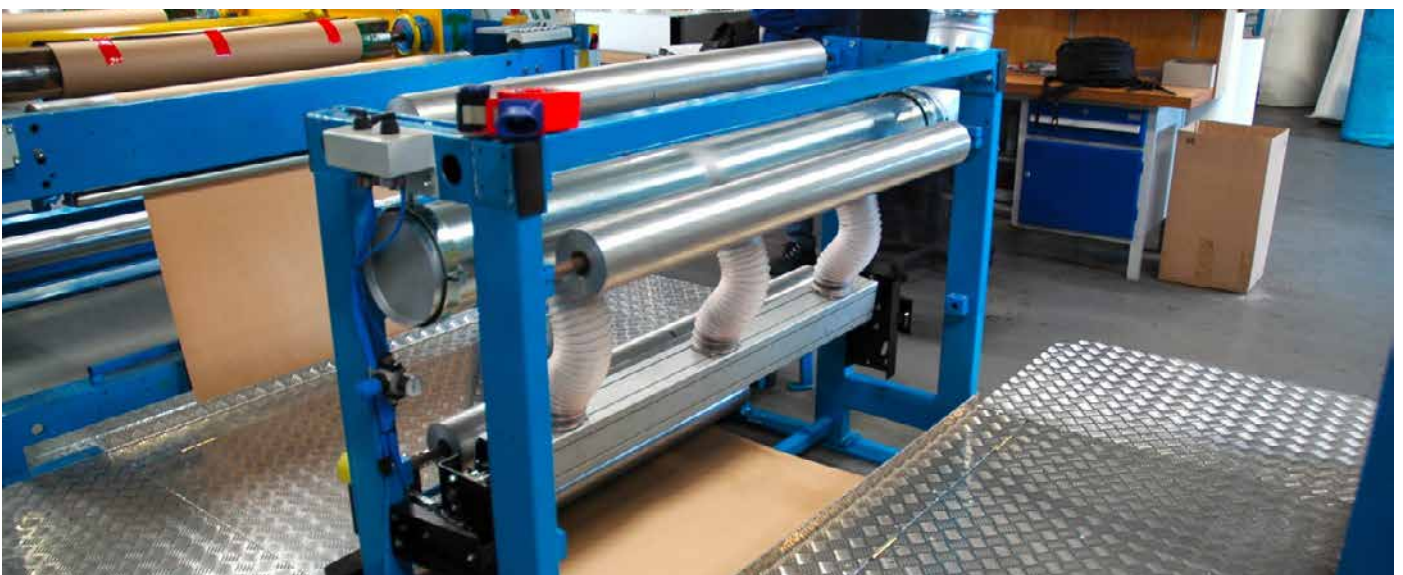
Absaugkopf, Rohrsystem und Cyklonabscheider Suction head, piping and cyclone separator