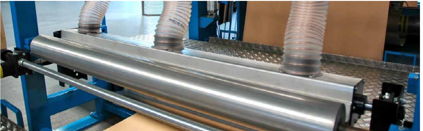
Absaugkopf in Position Suctionhead in position